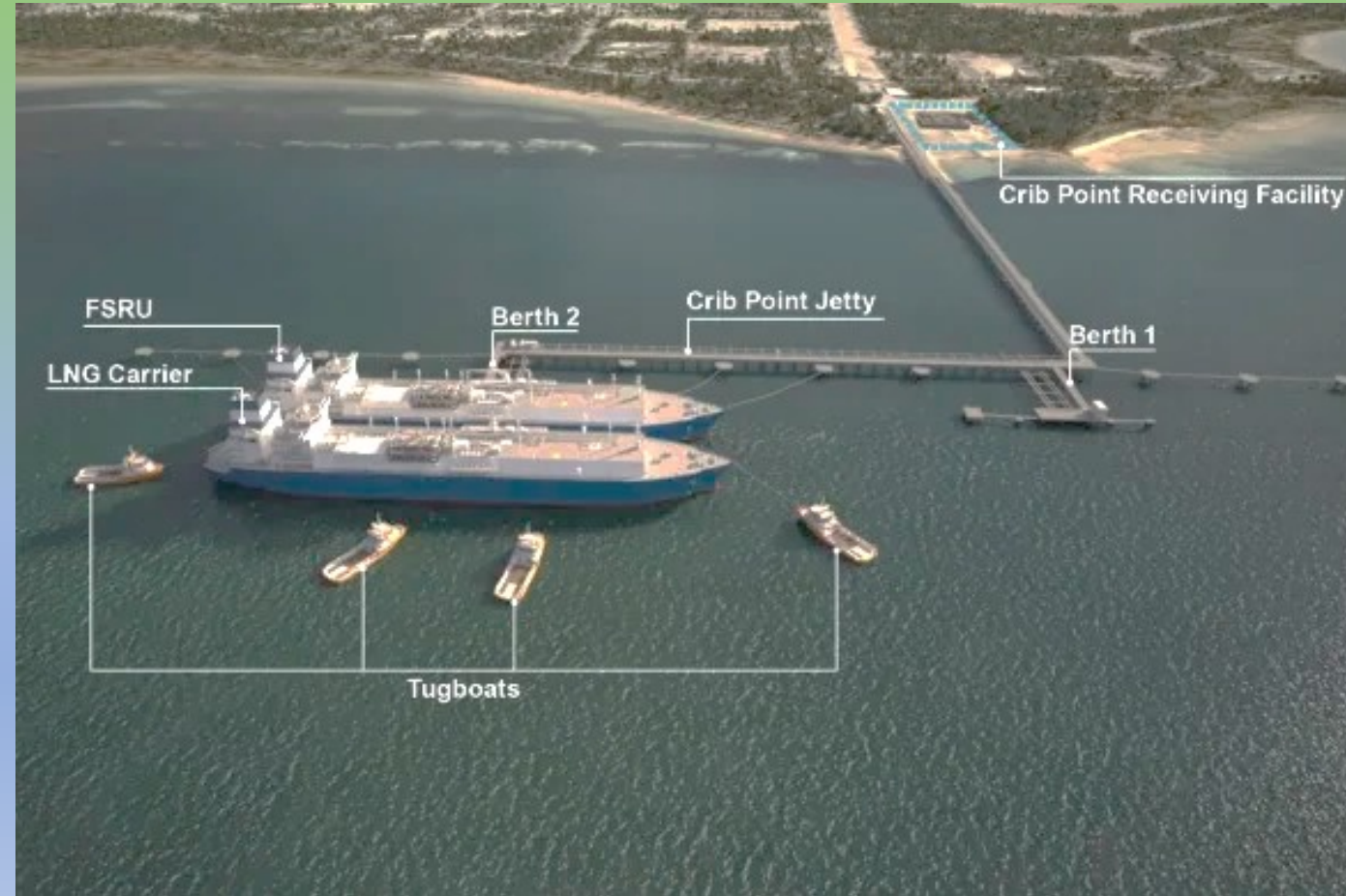
Generated image of the proposed Crib Point Floating Storage Regassification Unit facility in action.