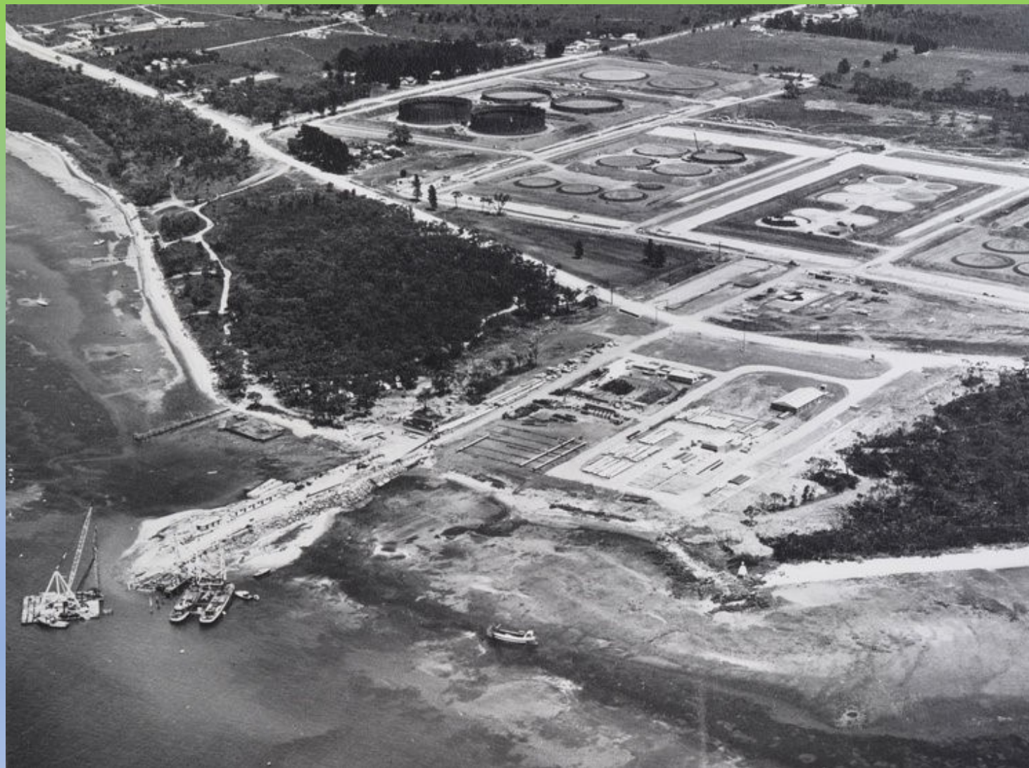
Port of Hastings being developed, circa 1960s.