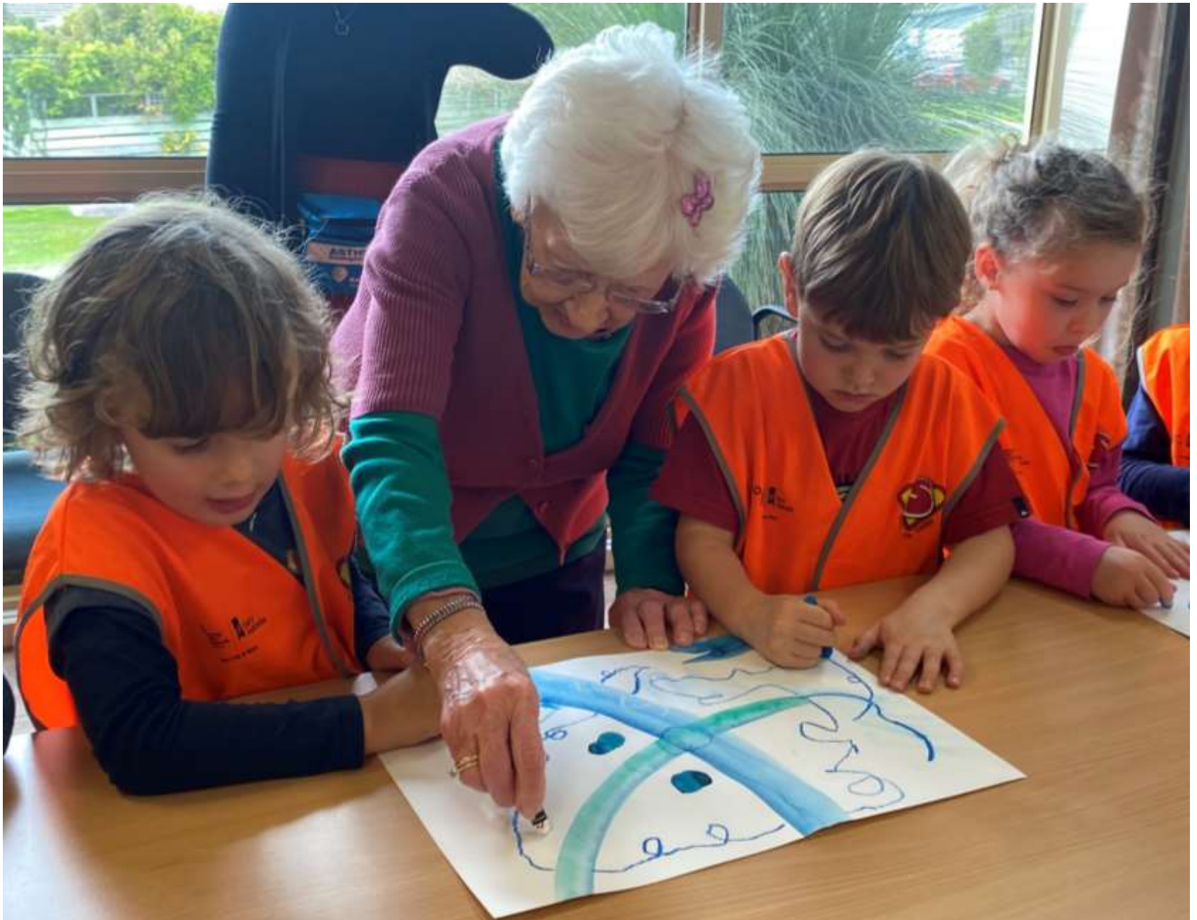
Earlier in the week ... Collaboration between Bass Coast Children's Centre and Rose Lodge Residents