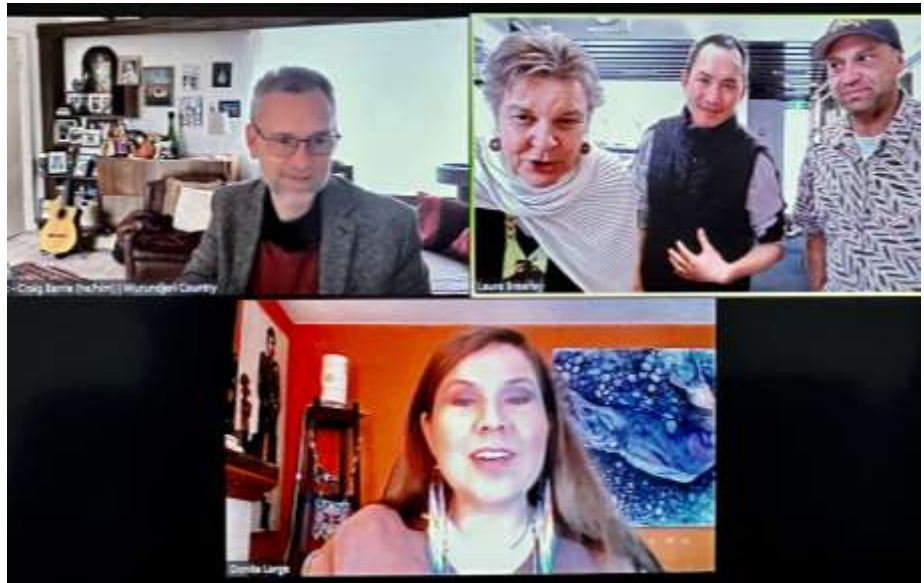
Introductions across the oceans