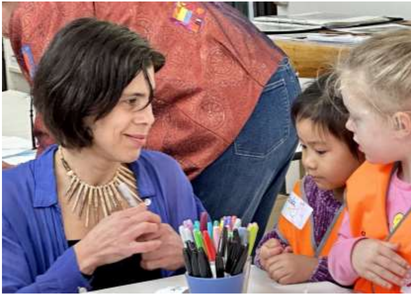
Collaborative Responses to Whale Songs