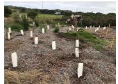
Plantings near the entrance

At our annual planting morning on 2 July, a wonderful group of 9 volunteers did a sterling job to dig holes, plant and guard 150 local indigenous species to revegetate 3 sites where Council and PINP had previously removed invasive species such as Bracelet Honey Myrtle ( Melaleuca armillaris ) and Coast Wattle.