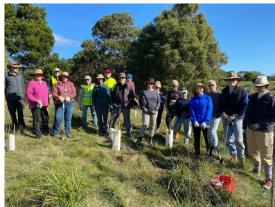
Three guard types were used depending upon the species - wire, carton, and new biodegradable cardboard ones.