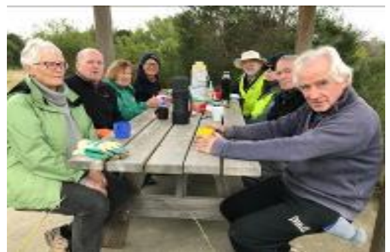
Volunteers relaxing at morning tea time!