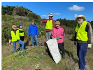
Removing a new infestation of thistles