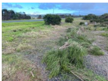
Piles of chopped bracelet honey myrtle

The FOSEER team is disheartened to see the lasting impact caused by Council's careless slashing along the paths back in January and are disappointed that volunteers' valuable time is taken up with repairing this type of damage when our time would be much better spent removing weeds which keep springing up. We sincerely hope that this type of damage doesn't occur in the future! As seen in photo below, we trialed our new black and red trolleys which made the task of carting heavy tools and bags of weeds much easier!