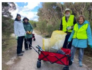
Red trolleys came in handy while tidying up the hacked vegetation along the tracks.