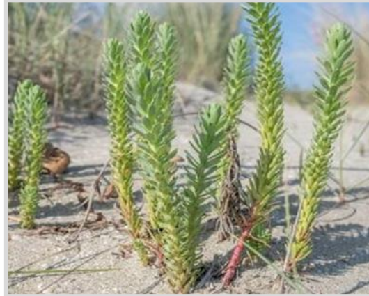
Sea spurge - remove using gloves and protect your eyes from white sap.