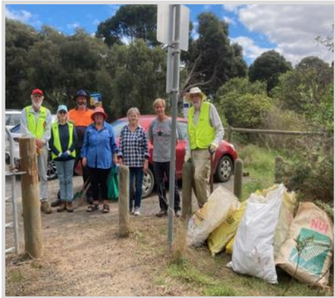
Sea spurge removal team