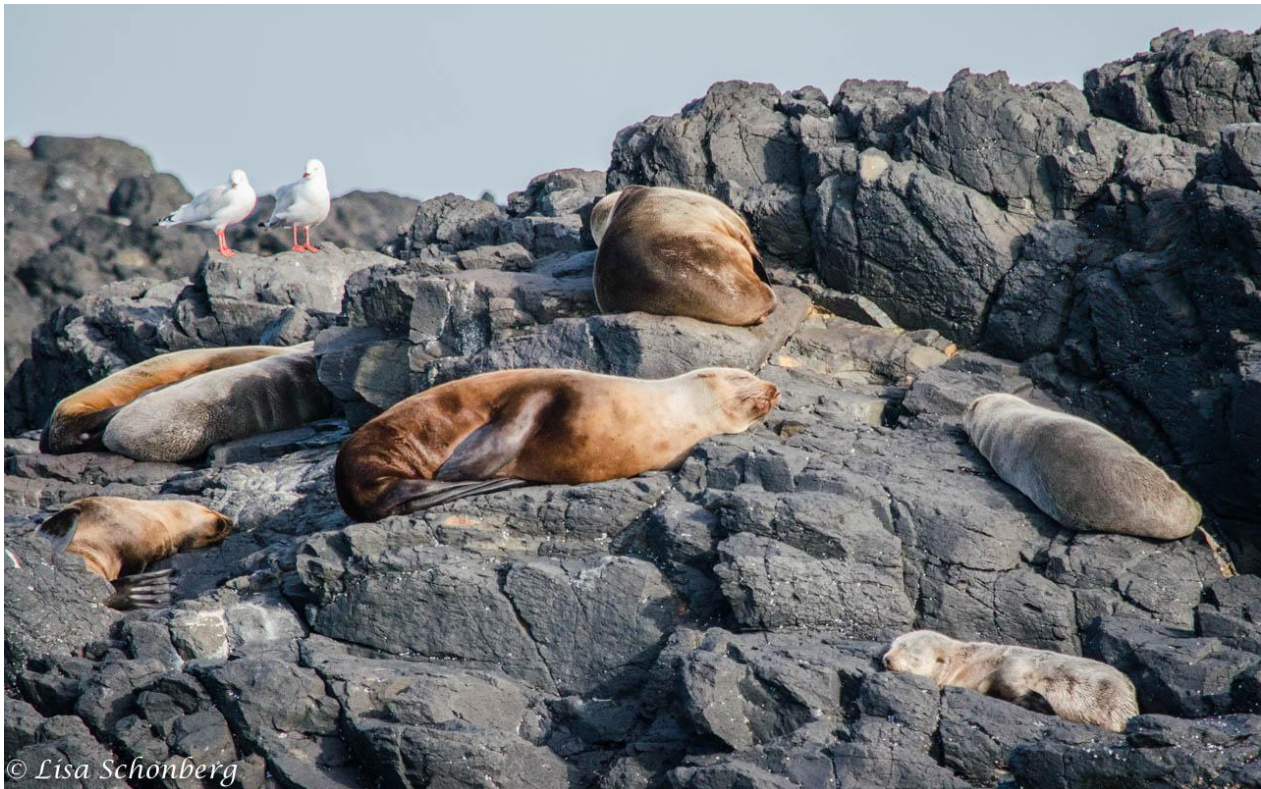
shows Australian fur seals at Seal Rocks

The event was held in the comfortable new theatre at the new Penguin Parade building. All PICS members got a great deal from the afternoon and thanked PINP for the opportunity to hear about some of the research being carried on by the Research Department, which punches well above its weight in terms of breadth, depth and output. We look forward to more updates from PINP's world-renowned Research Department.