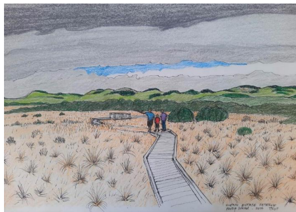
Terry Nott - Scenic Reserve 2016

These coloured pencil drawings were drawn shortly after the opening of the Reserve. It is interesting to note that since 2016 the melaleuca and other bushes have encroached upon this open grassland near the boardwalk. The Reserve is now 5 years old so these drawings may be of interest.