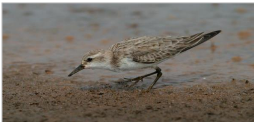
Red Necked Stint

Rhyll Inlet is a declared Ramsar wetland of international significance to protect the habitat of migratory birds.