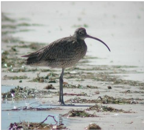
Eastern Curlew

In the Silverleaves Conservation Society latest newsletter PICS found this interesting information.