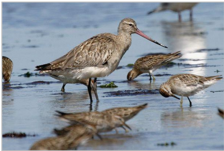
Bar Tailed Godwit: Photo Melbourne Museum